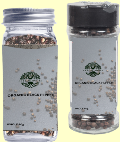
Glass Jars : 40g - 60 g Spices