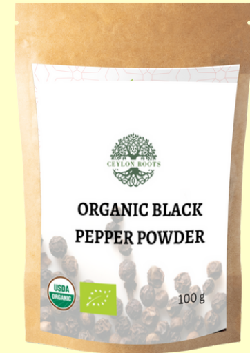
Resealable Triple Layer Kraft Paper Stand Up Pouch 100g (3.5 Oz), 454G (1LB), 500g