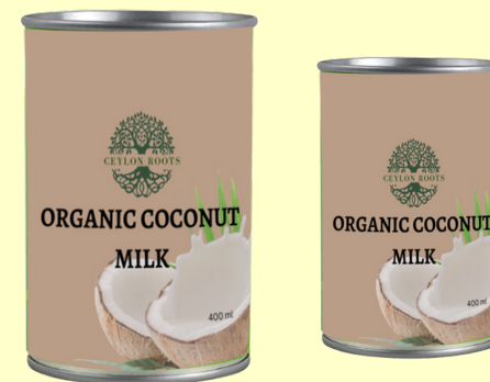
BPA Free Cans for Coconut Milk