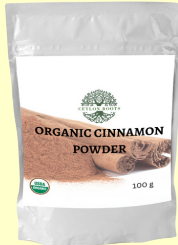
Resealable Triple Layer Alu- Foil Pouch 100g (3.5 Oz), 227 g (8 Oz), 45 4G (1LB), 500g