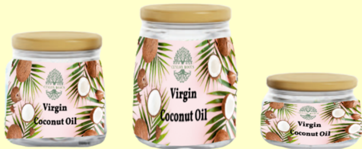
Glass Jars for Virgin Coconut Oil and RBD Oil (200ml, 300ml, 500ml, 1000ml, 1500ml)