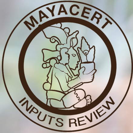
MAYACERT INPUTS REVIEW